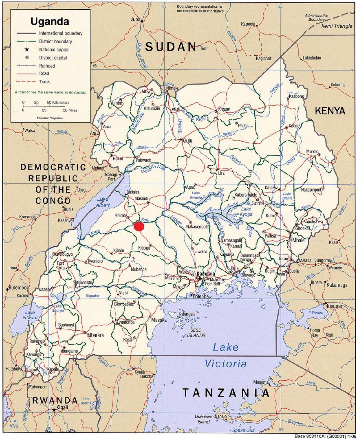
Figure 1: The location of the Kikonda Forest Reserve within Uganda