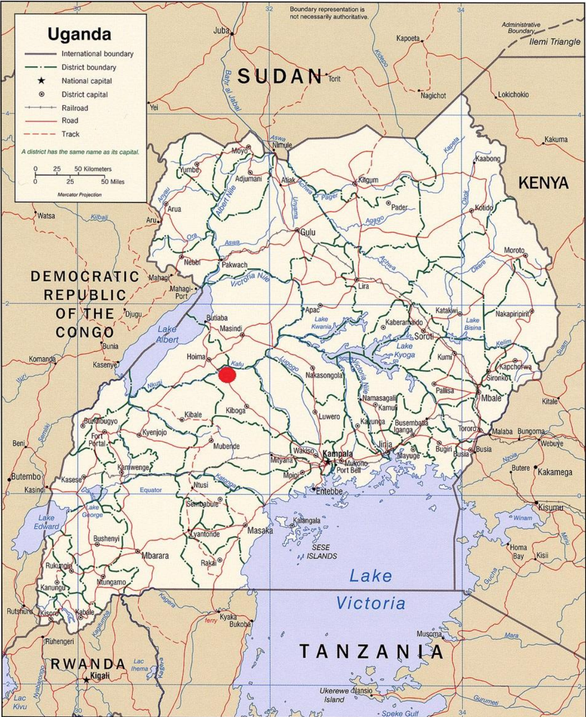
Base 803110A1 (G00031) 4-05

The external boundaries of the reserve were surveyed, and its boundaries fixed and approved in July 1968 and updated in December 1999 by implementing boundary marks and clearing of the boundary lines.